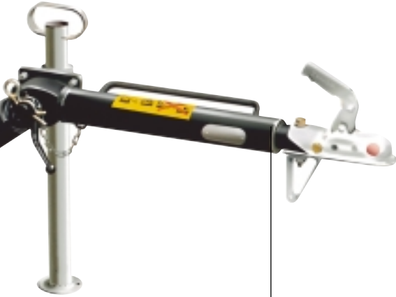
Efficient noise dampening

All units comply fully with the legal requirements for noise regulations.